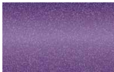
Grape Madness (120P)