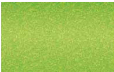
Grasshoper Green (127P)

Note: All colors are not available on every wheelchair. Please see specific order forms for exact color offering.