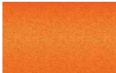
Sunkissed Orange (116P)