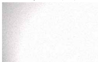
White Snow (29P)/Arctic White (143P)