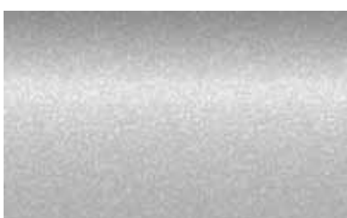
Silver Metallic (60P)/ Electric Silver (147P)