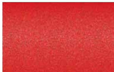
Tangerine Red (117P)