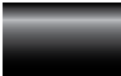
Wet Black (24P)