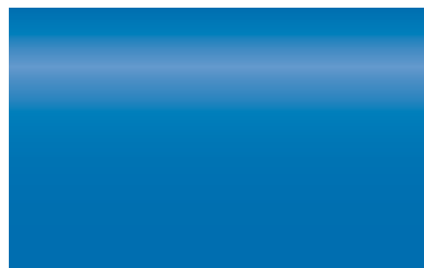
Electric Blue (62P)