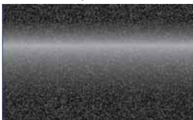
Black Prism (115P)